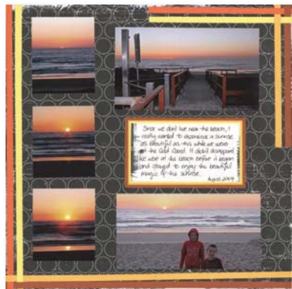
Layout by Victoria Murphy