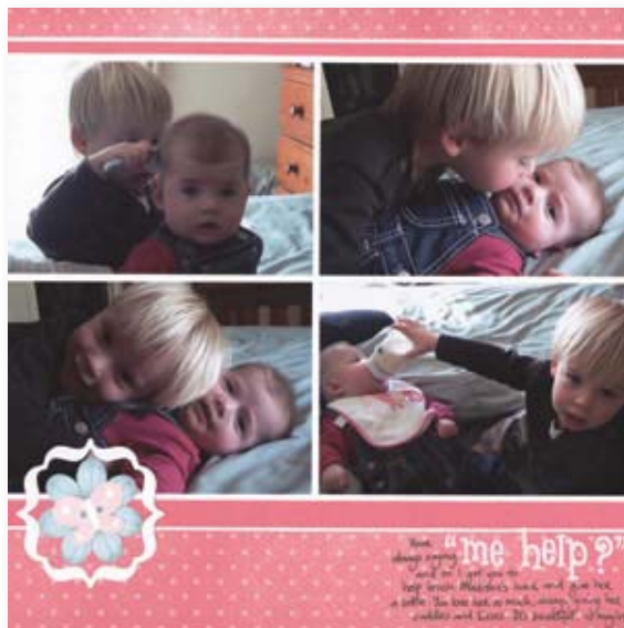
Layout by Megan White

What's important is that you're preserving the ordinary – and the extraordinary – events of your family's life.